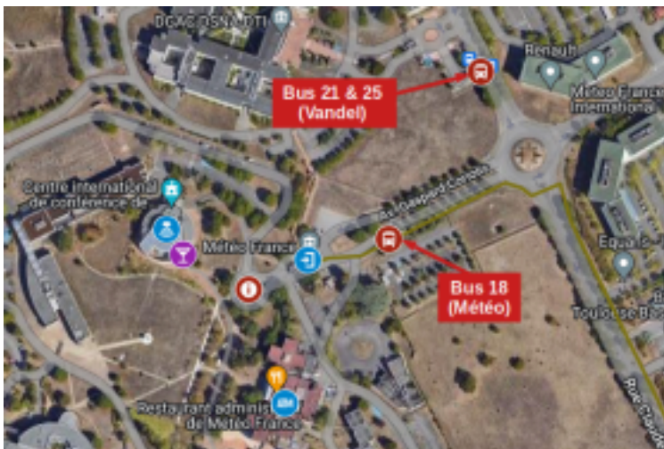
» Ligne 18 - Direction Cité Scolaire Rive-Gauche ou Arènes